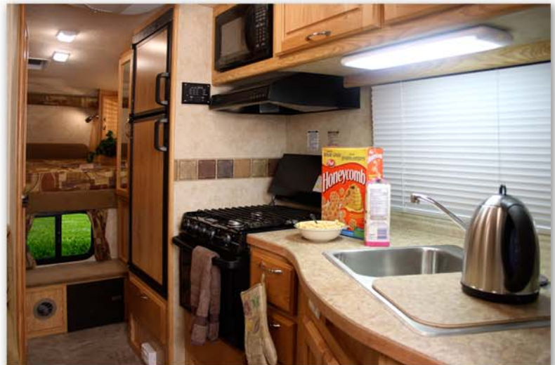
▲ Galley and Bedroom