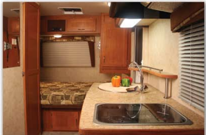
▲ Galley and Bedroom