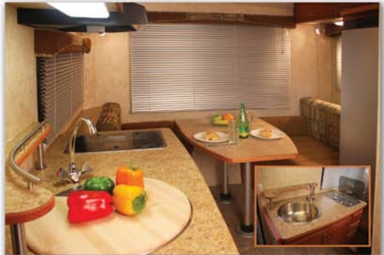
▲ Galley and Dinette

*To top of Refrigerator Vent ** Not including optional Front Cargo Box