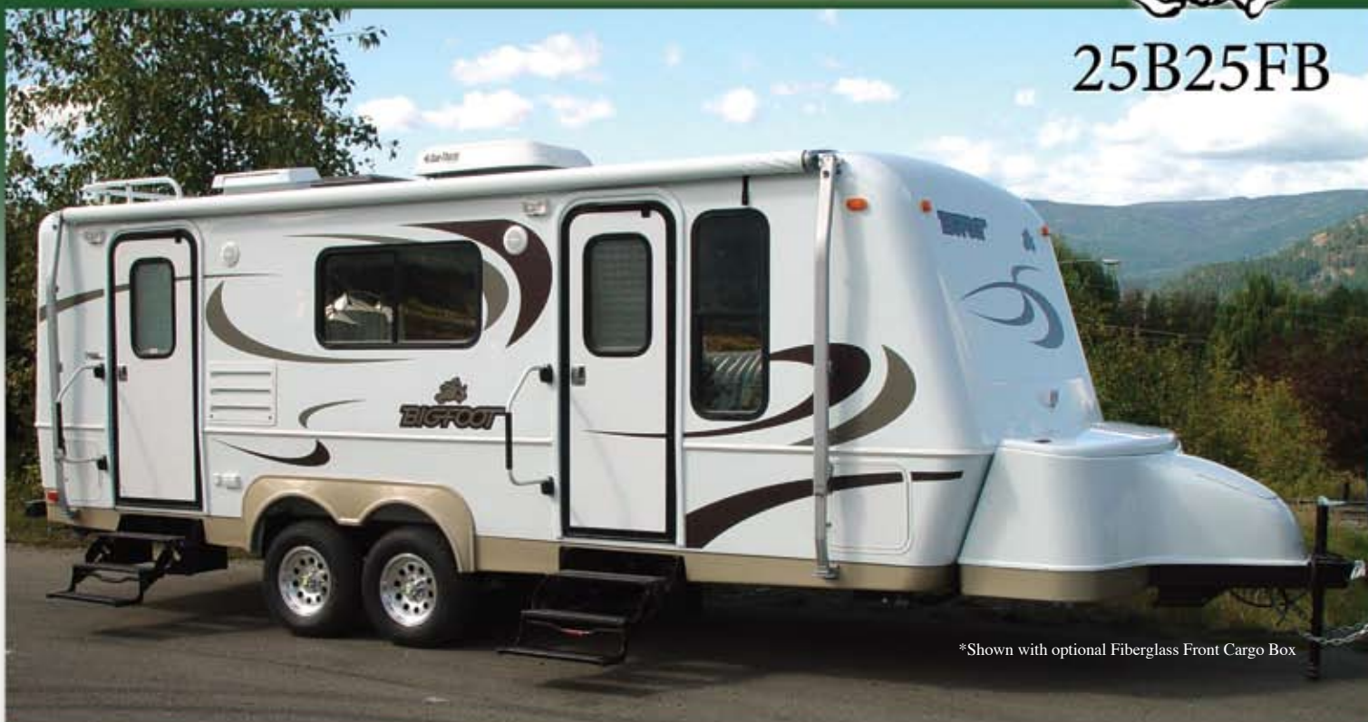
*Shown with optional Fiberglass Front Cargo Box