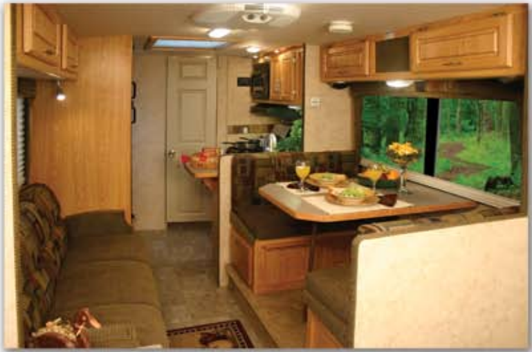
▲ Dinette and Love Seat