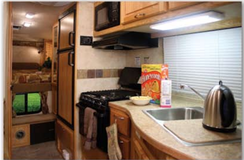
▲ Galley and Bedroom

This brochure may not be used for contractual purposes. Bigfoot Industries reserves the right to improve or modify its products without prior written notice.